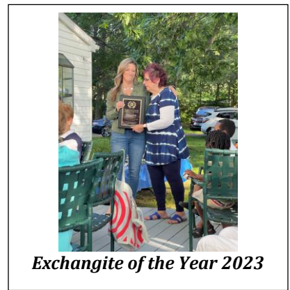
Exchangite of the Year 2023